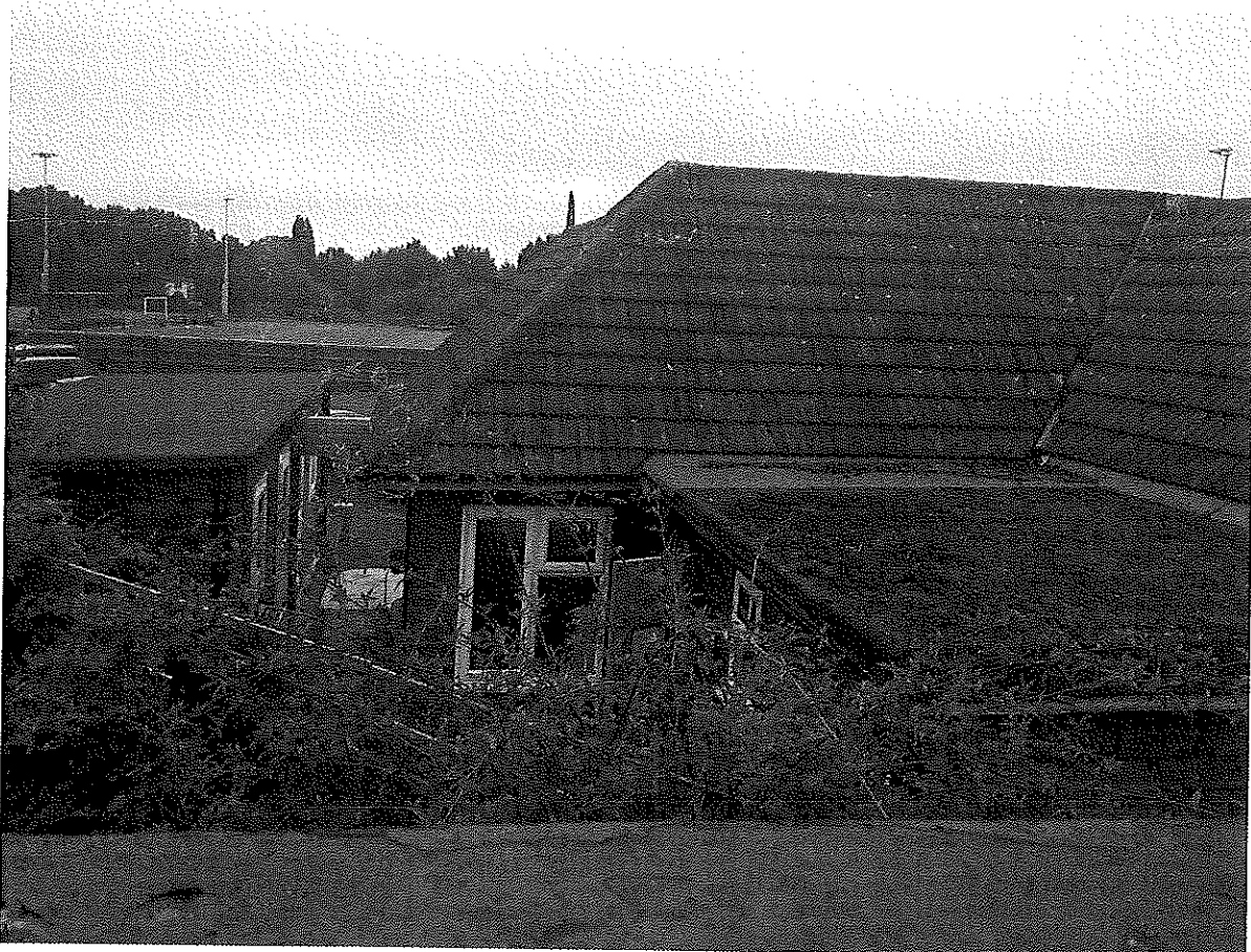
Picture 1. The view from the bedroom -

The distance between our house and the clubhouse is appx. 3m. Our bedroom, the kid's bedrooms and the showers are facing the clubhouse. We constantly suffer from loud noise and lack of privacy (see below picture 1). The rooms are very close and exposed to the clubhouse entrance, players go in and out of the clubhouse regularly. We are unable the leave the windows open before, during and after games – roughly 4 hours for each game. We also need to close the shutters.